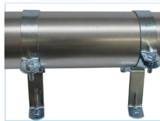
Duct mounted with Split Strap and Legs for Split Strap.