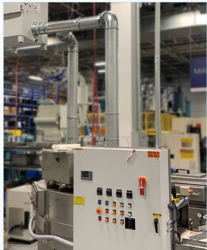
QFS Duct System installed