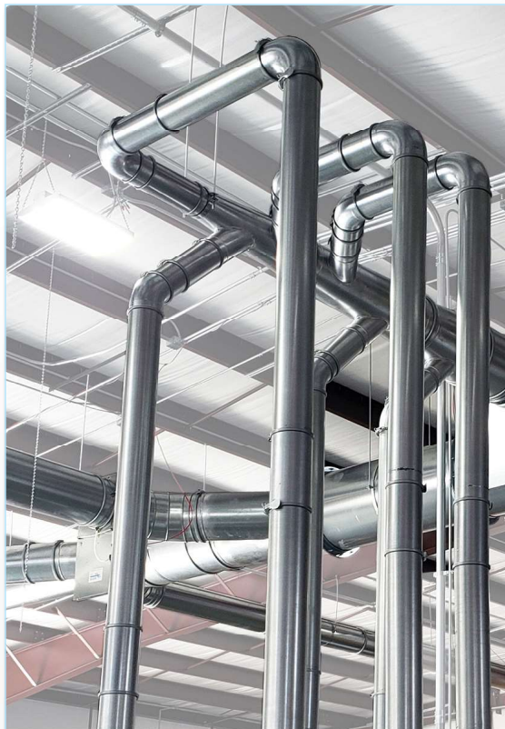
QF Duct System installed