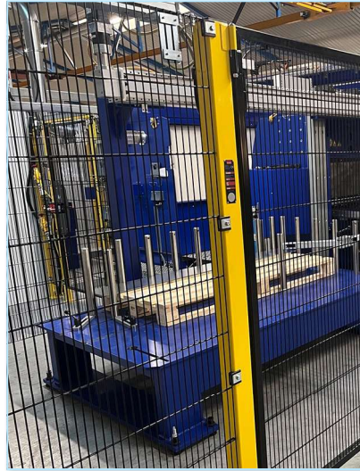
Nordfab Europe duct manufacturing.