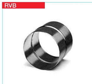
Duct connector made of galvanised steel.