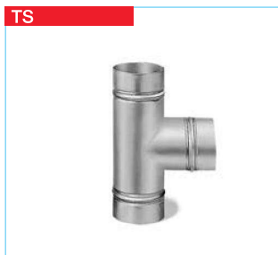
T-pieces made of galvanised steel.