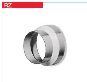
Reducers made of galvanised steel or polymer.*