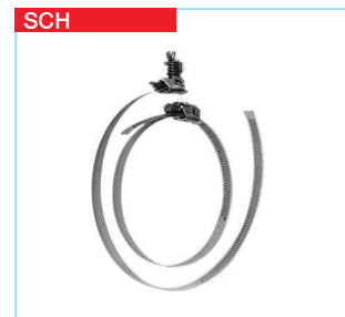
Hose clamps A steel band with a snap on tension lock. Supplied in quantities of 10 pieces.