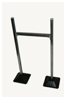
H Frame Kit