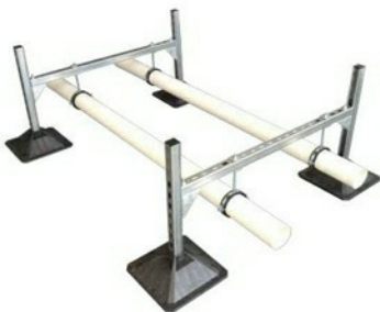
H Frame Kit (x2)