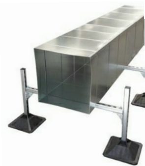
H Frame Kit (x2)